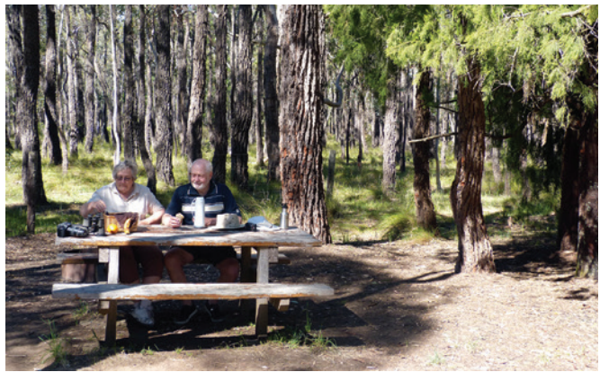
Ironbarks Picnic Area

Within Kuitpo Forest Reserve, there are four multi-use trails and one short walking/cycling trail. For more information regarding the extensive trail network within Kuitpo Forest Reserve, please visit or contact the Kuitpo Forest Information Centre.