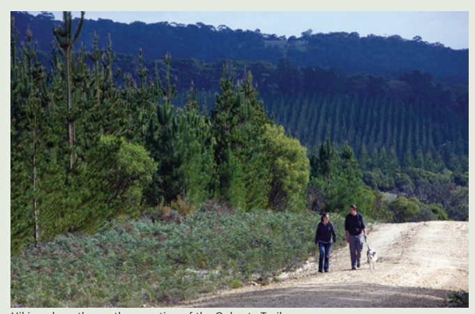
Hiking along the northern section of the Onkeeta Trail.

Native Forest Reserves offer the opportunity to see a rich variety of native flora and fauna species. The endangered Yellow Tailed Black Cockatoo can often be seen in the area.