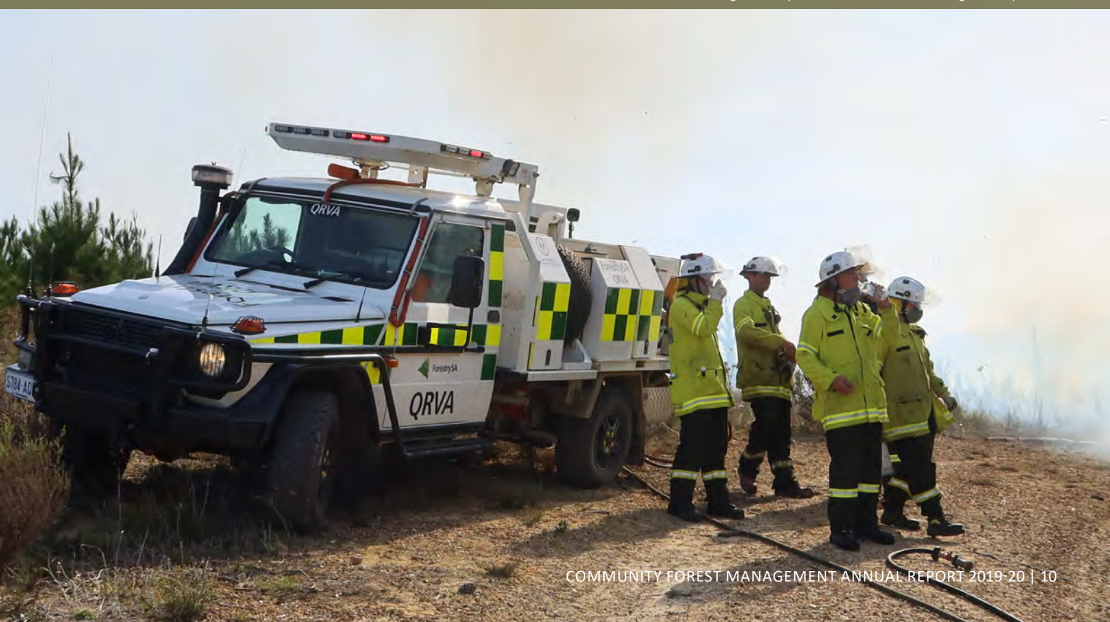
Image: ForestrySA fire crews take a break during a burn operation