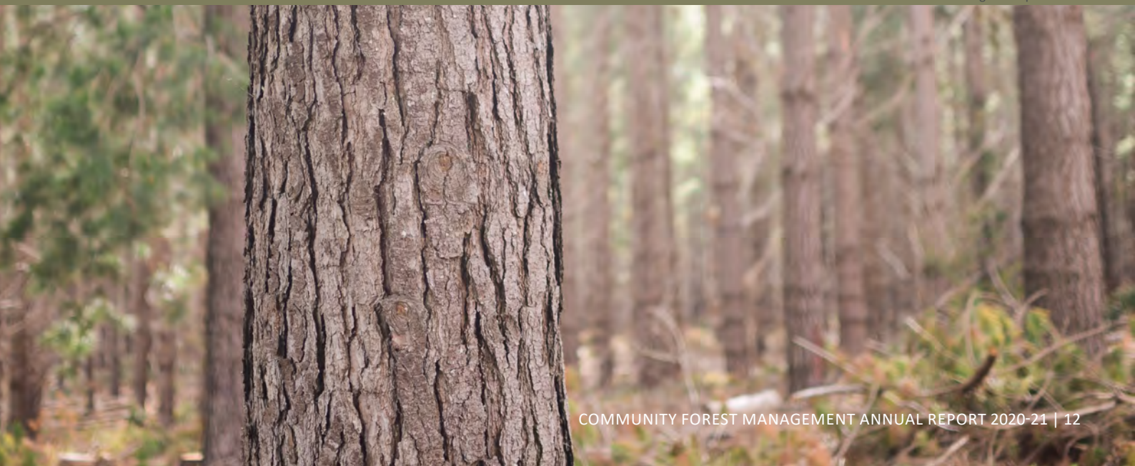
Image: Pine plantation