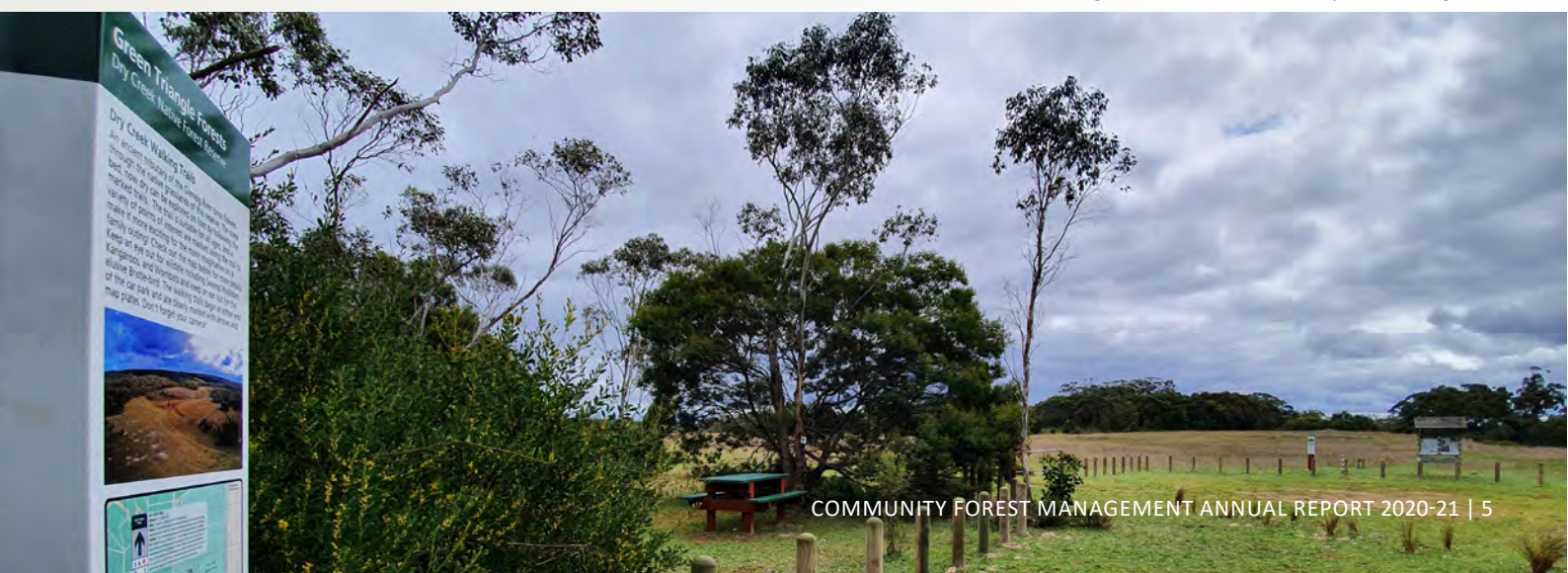
Image: New infrastructure at the Dry Creek Walking Trails