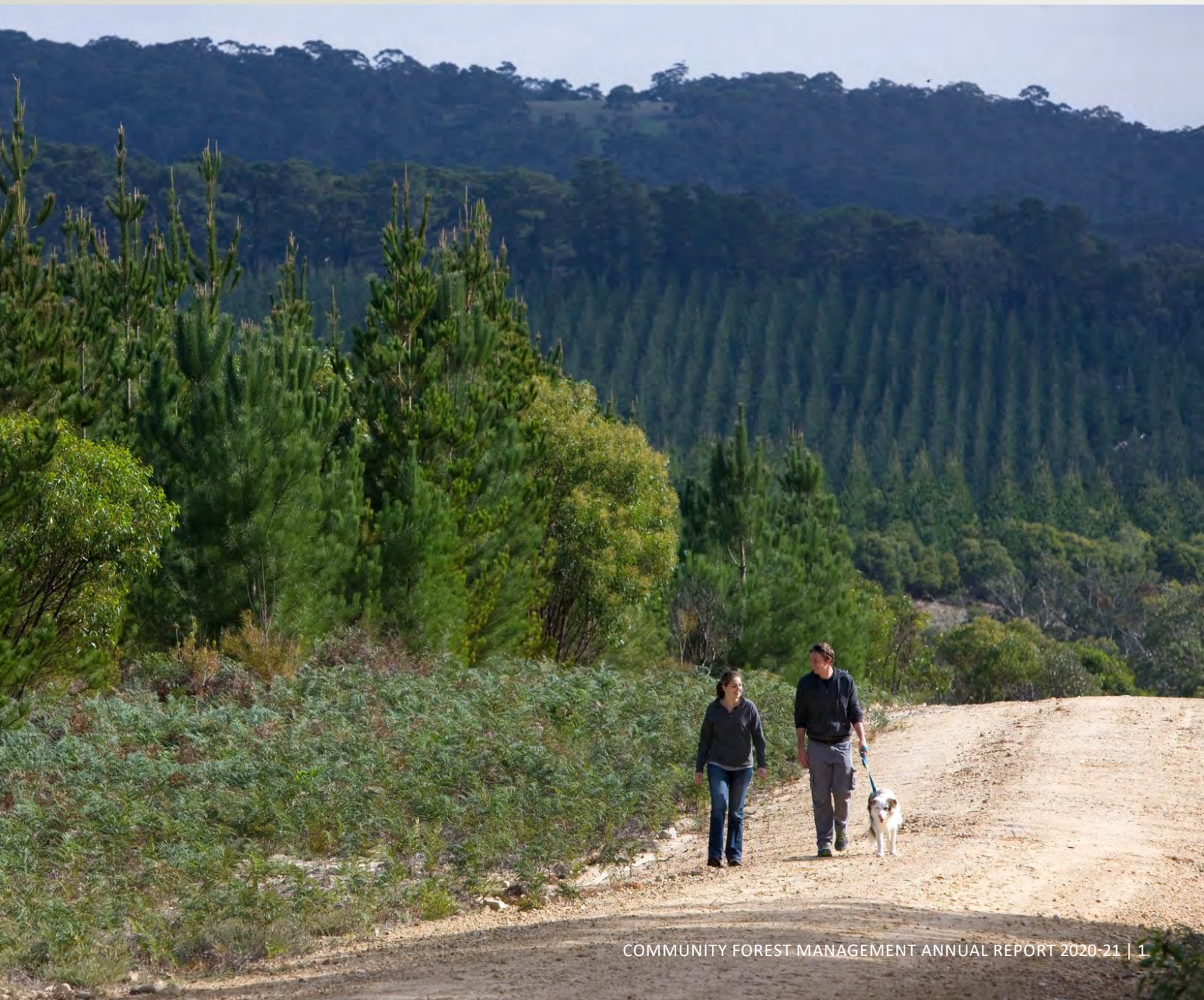
Image: Walking in the forest