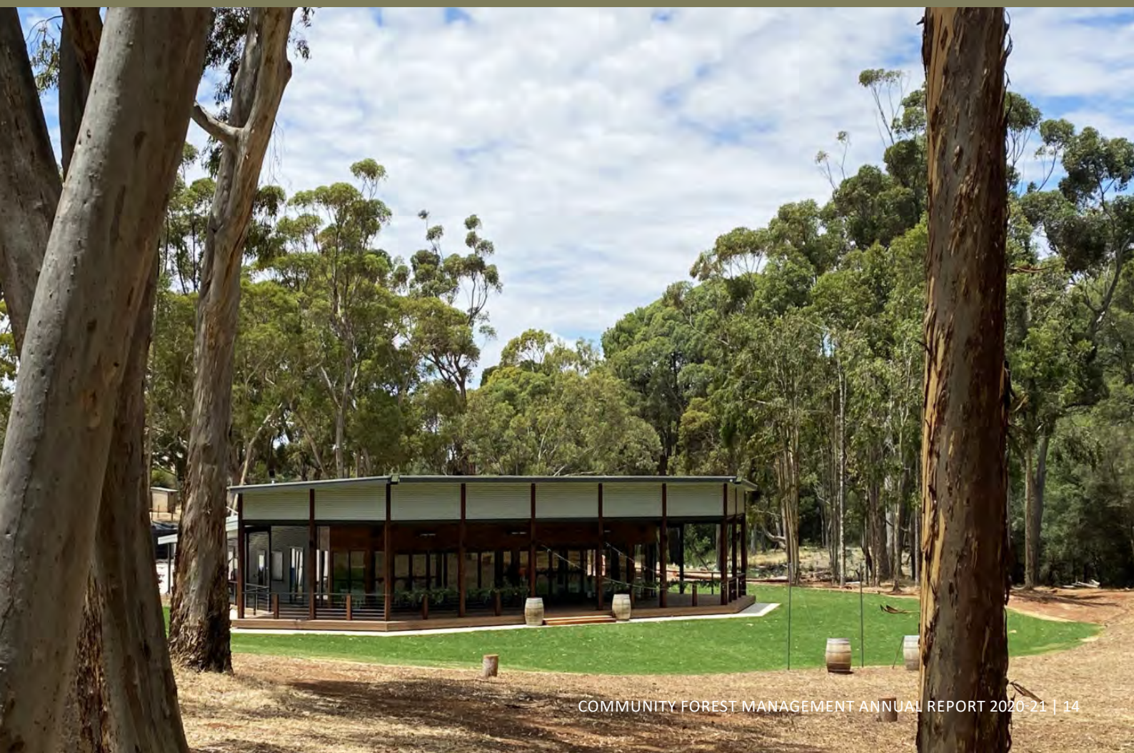
Image: New event centre Maple & Pine, at the Bundaleer at Bundaleer Forest Reserve