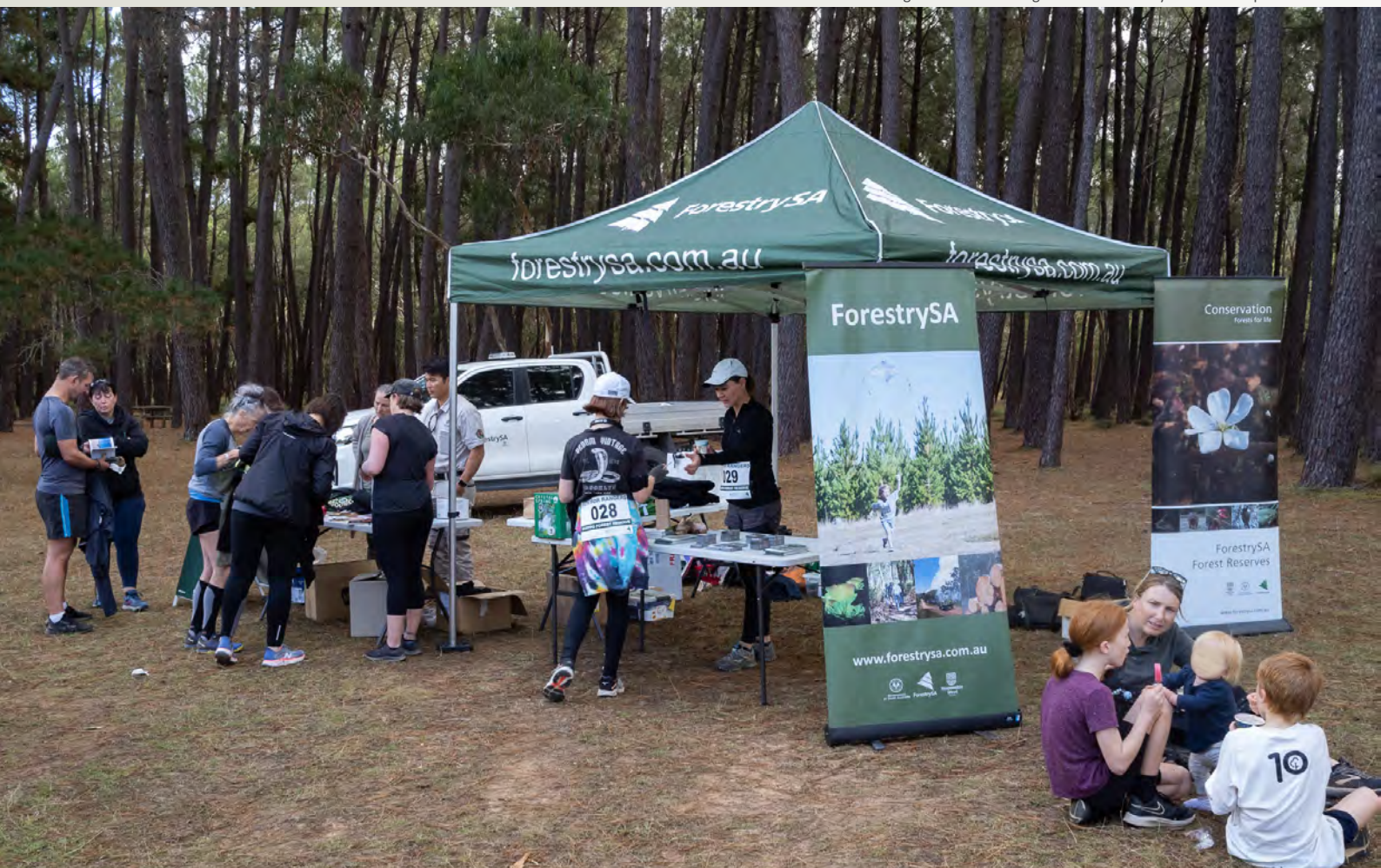
Image: The Run for Rangers Fun Run charity event at Kuitpo Forest