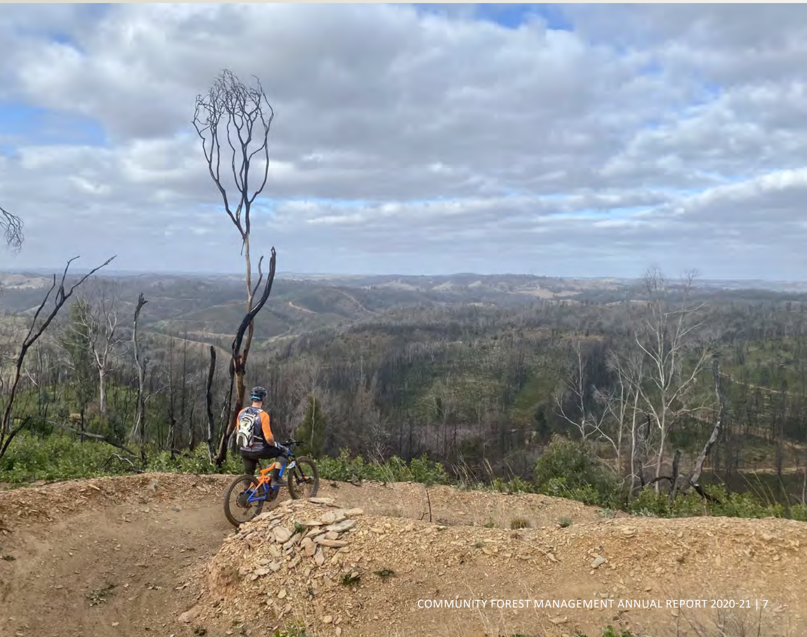
Image: Reopening ride at the Fox Creek Bike Park, 11 April 2021.