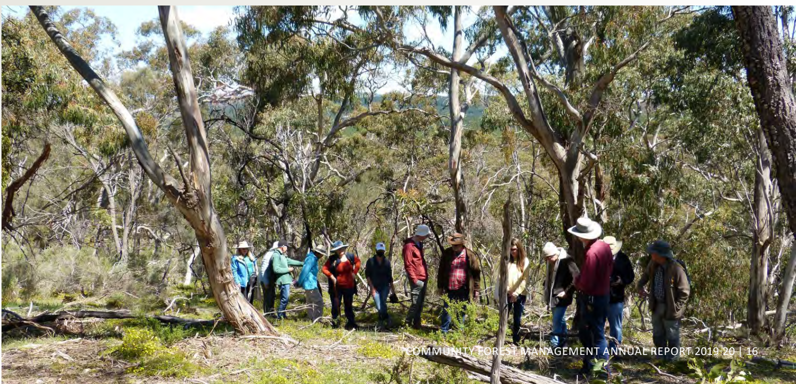
Image: A field trip to Little Mount Crawford Native Forest Reserve

ForestrySA's Policy for Sustainable Forest Management is available at www.forestrysa.com.au/plantation-forestry