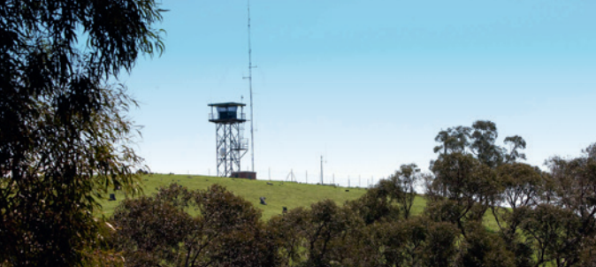
Mt Crawford Fire Lookout Tower

It is an offence to cut down or damage any living or standing vegetation, or to remove any timber from a forest reserve without permission.